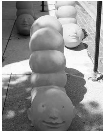
Harrison & Lombard Catch Up – Shencheng Xu