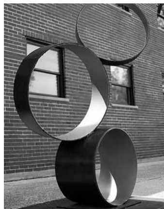
333 Harrison Street Tread – Dusty Folwarczny