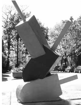
Harrison & Lyman Popsicles