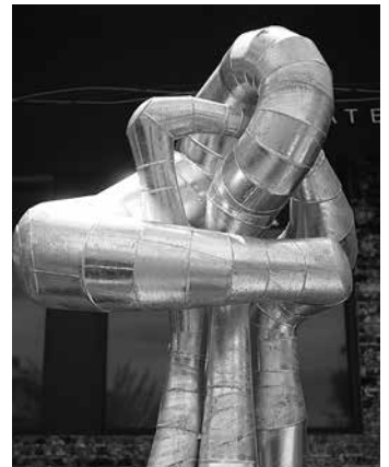
235 Harrison Street Nutrition Sculpture – Will Vannerson