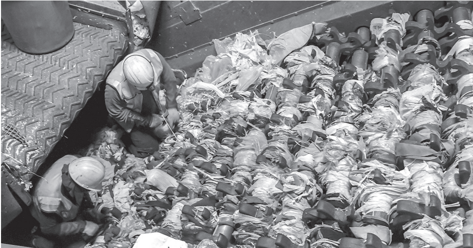
Waste Management workers risk life and limb to remove plastic bags caught in the recycling equipment.

O ak Park ranks among the most conscientious municipalities in the region when it comes to diverting materials away from landfills and into recycling.