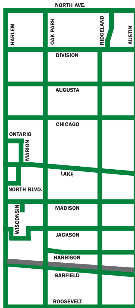
Snow Route Map

Sidewalk shoveling required... Residents and businesses are urged to help improve walking conditions and public safety by removing snow and ice from sidewalks after a storm. Village ordinance requires snow and ice to be removed from the public sidewalk within 24 hours following any snow, sleet or freezing rain. If the snow or ice has become too hard to remove without damaging the sidewalk, sand, salt or other abrasive material may be used to make pedestrian travel reasonably safe. Being a good neighbor is important, too, so property owners are urged to help those who may need help clearing a sidewalk. Failure to clear a sidewalk fronting or abutting one's property could lead to a ticket and fine. For more information on the shoveling requirement or help finding resources, call 708.358.5700 or email publicworks@oak-park.us .