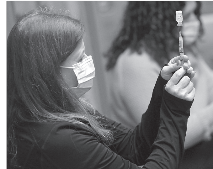
Nurses ready syringes for vaccinations at a Village-run clinic.

More information... For more information on the April 6, 2021 Consolidated Election, including polling sites by address, visit www.cookcountyclerk.com/elections .