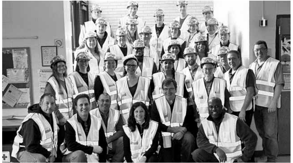
Oak Park's Community Emergency Response Team (CERT).

Three, day-long training courses focused on first aid, basic firefighting and emergency response techniques. Hands-on workshops taught